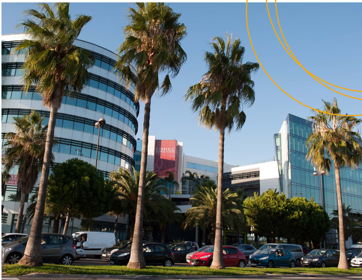
EDHEC Business School Campus, Nice

HEC Paris is recognized as one of the world's best business schools, and is currently ranked highest in France, and the world, for its master's in management and master's in marketing programs, as well as being the only French school in the global top 10 for MBA study.